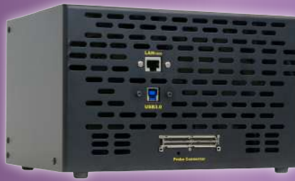
OEM - PA 128/128