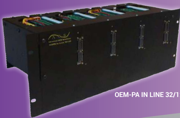
OEM-PA IN LINE 32/128