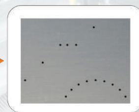
Aluminum Block with 1mm Side-Drilled Holes