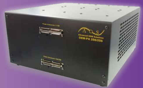
OEM - PA 256/256