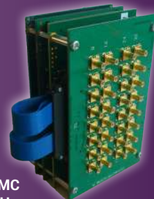
OEM-MC 32 CH